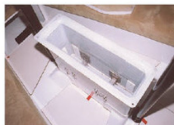
The robust lifting keel trunk is bonded to the interior grid system.

The portside galley module in the Andrews houses a single-burner Orego alcohol stove, fair-sized cold box and a molded sink, which draws freshwater from a five-gallon jerry can.